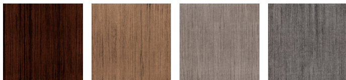
Merbau (MB) Spotted Gum (SP) Eucalyptus (EU) Ironbark (IB)